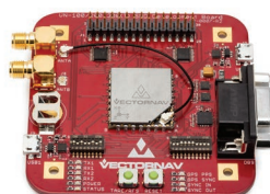
VN-200 Surface Mount