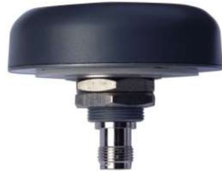
TW3320/TW3322 Shown with Low Profile Radome. Conical Radome also available

The TW3320/3322 is housed in a permanent mount industrial-grade weather-proof enclosure. Two options for pole mounting are available an L-bracket (P/N#23-0040-0) or a pipe mount (P/N#23-0065-0)