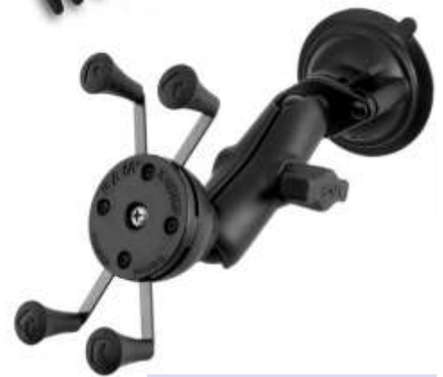
CTL3510 universal mount